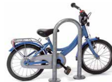
Children's bike brace F5-R can be found on page 168